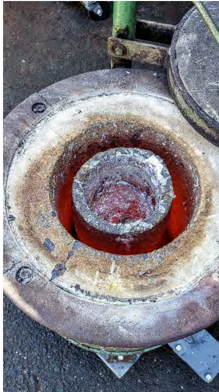
The crucible located in the center of the foundry furnace melts the metal to pour into customized molds.