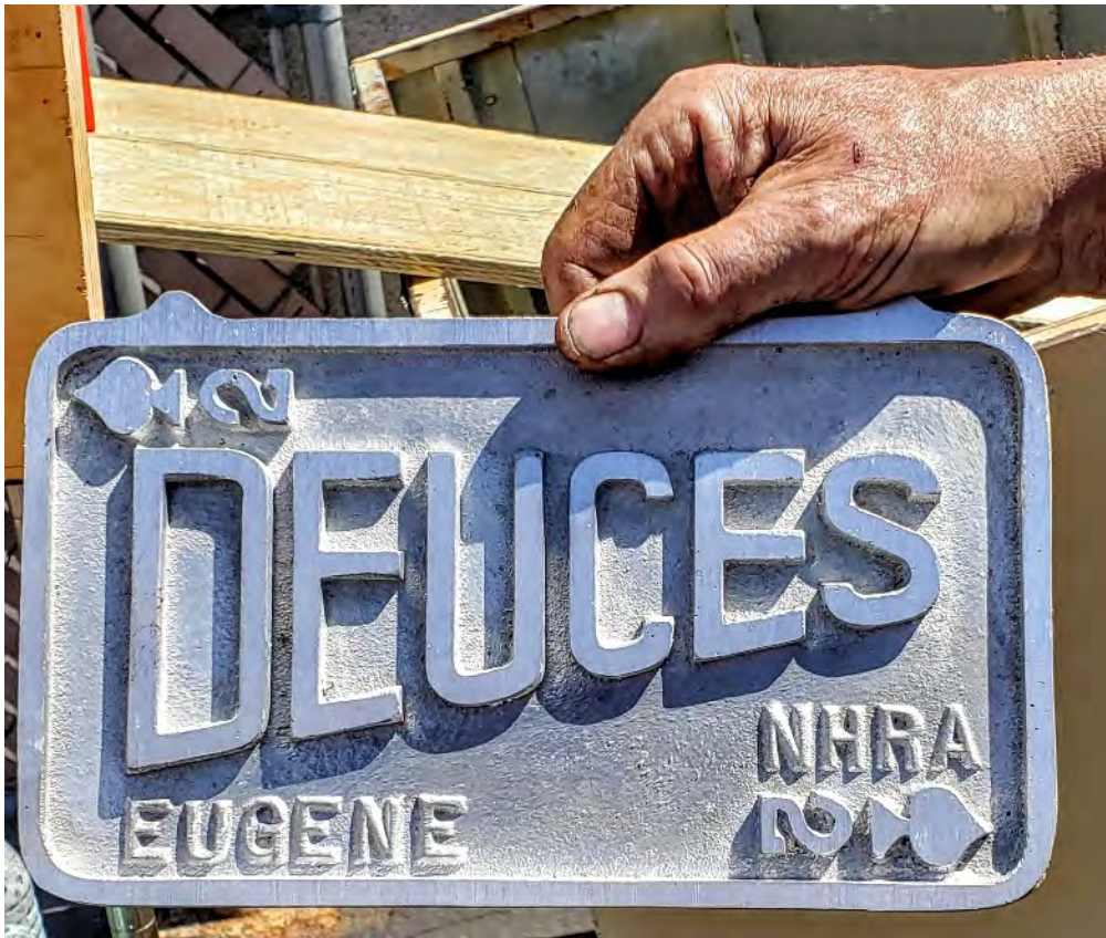
Customized car 'drag plates' are made at the Foundry.