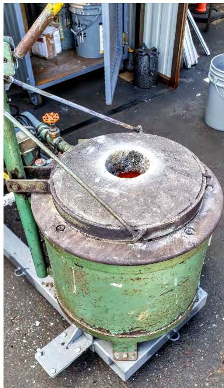
The foundry unit melts the metal to cast into customized parts.